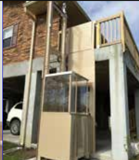
Elevators - Outdoor