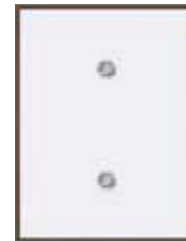
Two recessed LED Standard

Ceiling designs and lighting options may be mixed and matched.