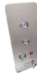
Stainless Steel Standard