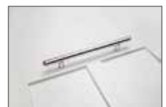
Round Bar Available Upgrade