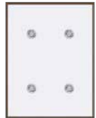
Four recessed LED Available Upgrade

LED lights, 3" diameter, stainless steel trim ring.