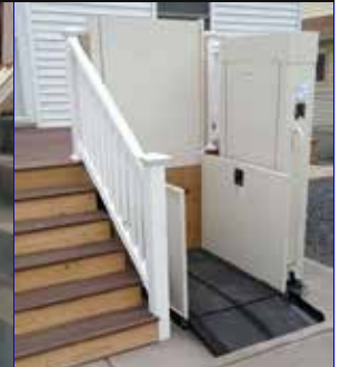
Vertical Platform Lifts