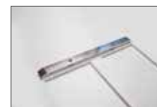
Flat Bar Standard